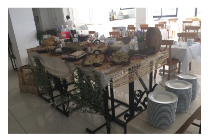
Anmaria Beach Hotel

At the corner of the Cyprus Breakfast guests can taste the traditional delicacies and aromas through the local products of Cyprus, combining our gastronomic richness with our hospitality.