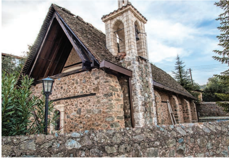
Agios Nikolaos Tsakistra

mountain community of Kampos with its stately sycamore and oak trees and sparkling fresh water springs which you can taste at the fountains in the centre of the village. Look out also for the old village olive press, the water mills, the Folklore Museum and