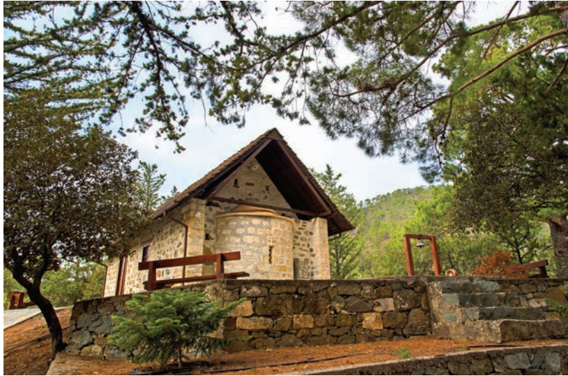
Holy Cross church 'Stavros tis Psokas'

The road to the valley is full of tight turns and requires slow driving and some patience. Park beyond the tight corner and you'll find yourself at the starting point of a short hike up through the valley all the way up to the peak of the Tripylos