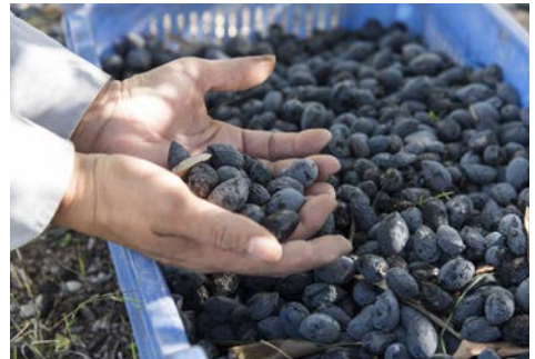
Kantou Olive picking

Drive south, past the Kouris dam to get to Kantou, with its 16th century limestone Byzantine