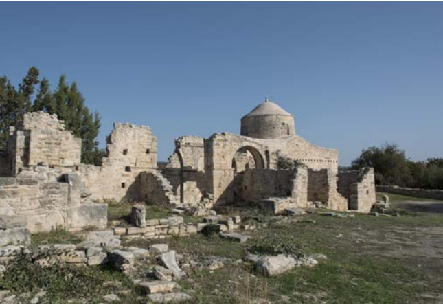
Timios Stavros, Anogyra

Go up to the paved village square, where you will find the island's only Carob Museum and Factory. The village is especially known for preserving the traditional method of making pastelli, a popular carob-based sweet, celebrated annually with the Pastelli Festival in September. Also worth a visit is the village's 14th century limestone well.