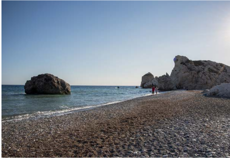
Petra tou Romiou

A few kilometres down the road, while driving along one of the island's most beautiful coastlines, lies Petra tou Romiou, a striking geological formation of large and tall rocks, better known as Aphrodite's Rock. According to mythology, this is the birthplace of Aphrodite, the Greek goddess of love and beauty and daughter