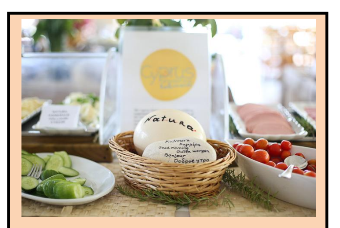
Natura Hotel: Cyprus Breakfast is explicitly branded at the hotel buffet through the logo