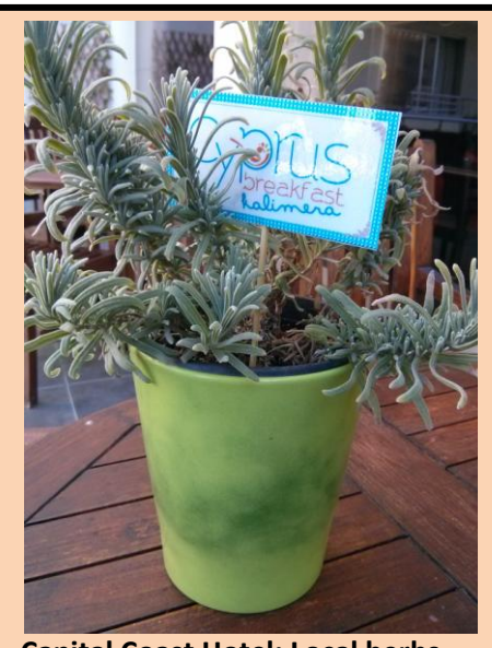
Capital Coast Hotel: Local herbs for a Cyprus Breakfast welcome