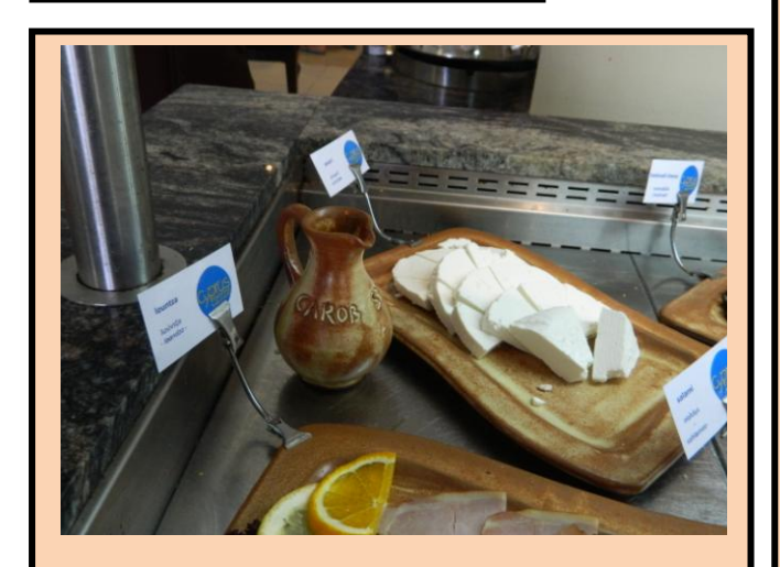
Louis Ledra Hotel, pairs carob syrup with anari cheese, an authentic combination of the Cyprus Breakfast