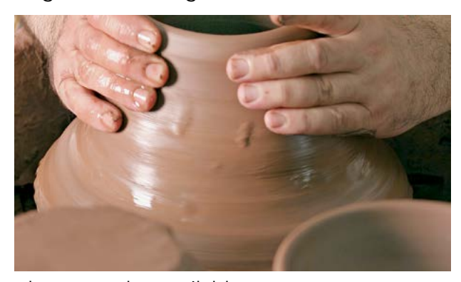
shops are also available.

family recipes passed down for generations. Some of the most popular products are local cheeses like Halloumi and Anari; cured meats infused with wine and spices; crusty village bread and rusks; delectable treats made of carob and grape; preserved spoon sweets from local fruit, vegetables, peel and rind; sugar-powdered Cyprus delights with a romantic link to Goddess Aphrodite, and many more enticing products made with love and heritage. Organised cooking demonstrations and work-