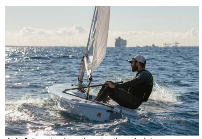
sightful and educational cultural sights.

A large number of family-friendly cafes and restaurants welcome young patrons and cater for them with special children's menus and facilities, including playgrounds or toys on their premises.